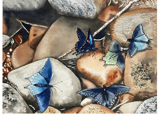
Painting by Lynda Chandler

SVWS continues to grow and evolve. Thirty-two current members and several new possibilities are swelling our ranks, which means renewed passions to explore and unique ideas galore. With your requests for a focus on more art and inspiration, and less on business, our officers meet and chat several times each month to discuss how to make our monthly meetings as rich and juicy as possible.