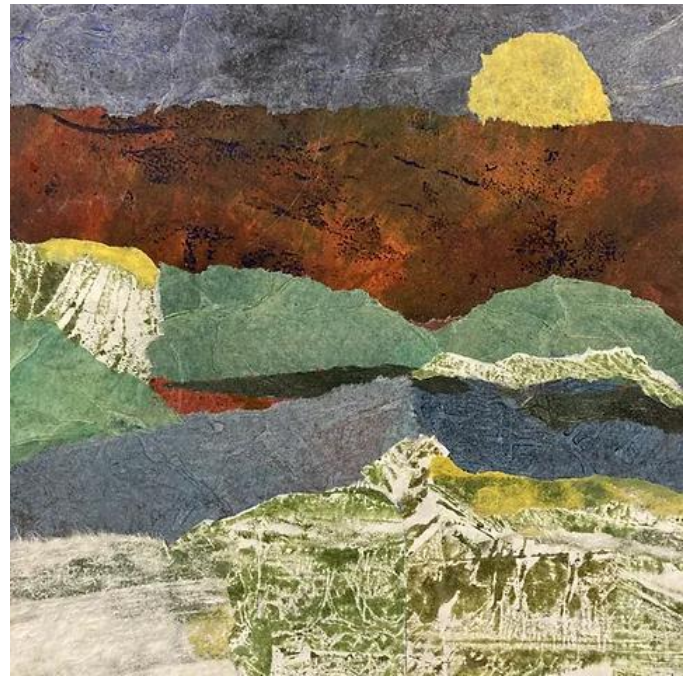
Watercolor Collage by Lourene Bender

And honestly, isn't that moment what we all strive for?